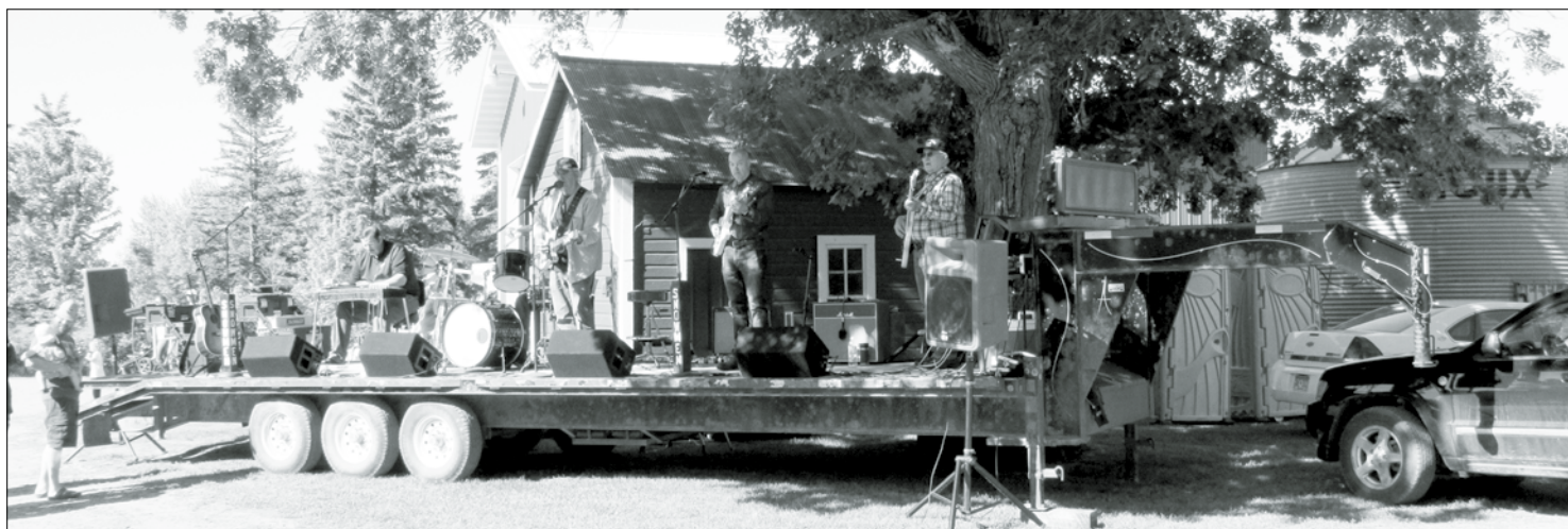
The Snowmen entertained the crowd during this years Breakfast at the Farm at Hilltop Ranch in rural McIntosh. The breakfast event is a fundraiser for Freedom Christian Academy and draws many community members who come out to enjoy a good breakfast and entertainment.