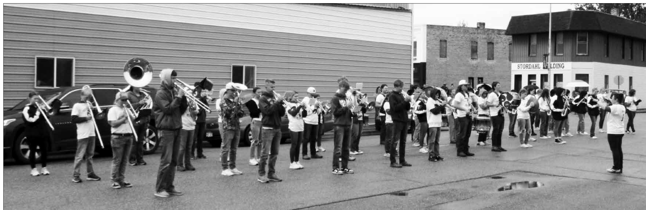
The Win-E-Mac Marching Band performed during the McIntosh Memorial Day event playing patriotic songs for the crowd.